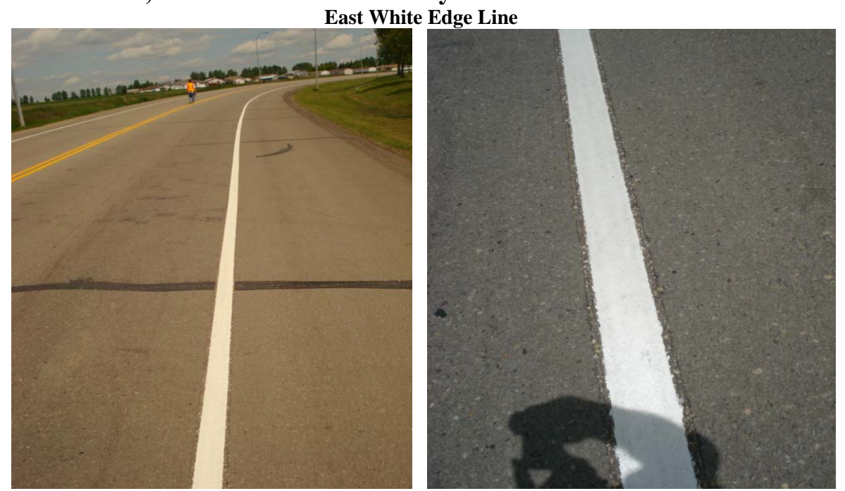
Retro readings–294, 287, 278, 301, 292, 286, 294, 270, 305, 321, 315, 301– Average retro = 295 Mcd Retro-reflective readings at this location are very good.