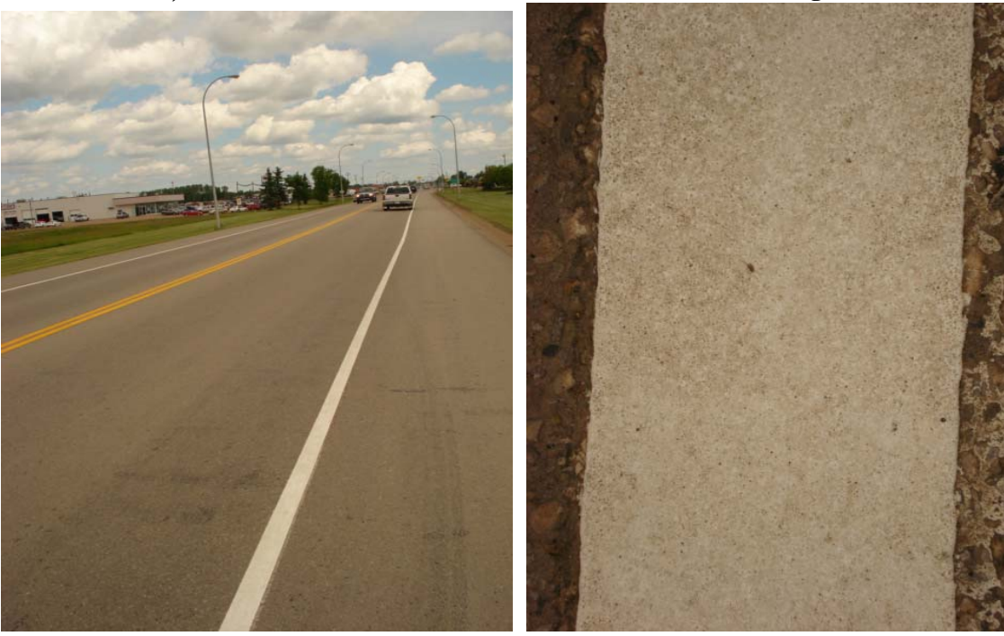
Retro readings–326, 325, 304, 315, 328, 326, 334, 323, 325, 320, 296, 325, 320, 294- Average retro = 319Mcd , Initial retro-reflective readings are very good at this location, marking looks very good, lots of glass beads in the marking.