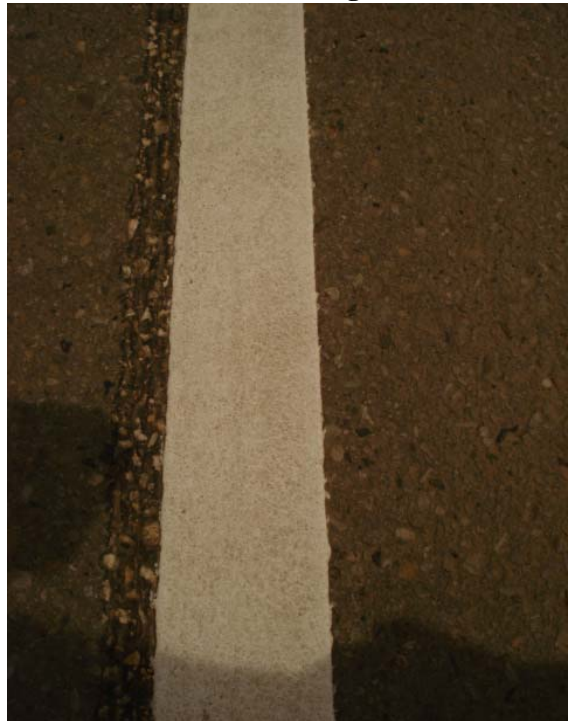
Retro readings–255, 287, 212, 179, 180, 250, 190, 182, 189, 190, 224, 208, 268, 228- Average retro = 217Mcd, Initial retro-reflective readings are considerable lower than location # 1. This could be attributed to dirt being tracked over the lines. Time will tell on the longer term performance.