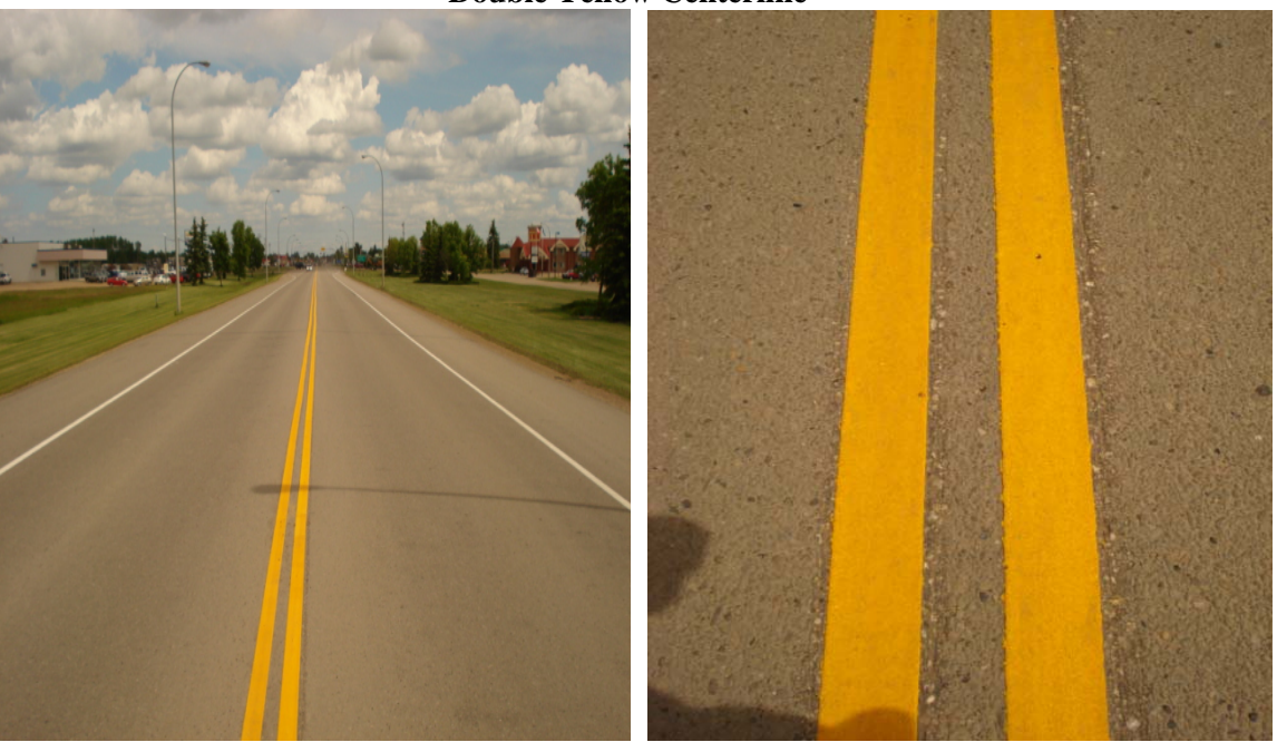
Retro readings-206, 162, 179, 164, 170, 180, 155, 191, 171, 191, 194, 218,164, 188- Average retro = 181 Mcd The yellow line appeared to be have a bit of dirt on some sections which resulted in lower initial retro's., otherwise the yellow line looks very good.