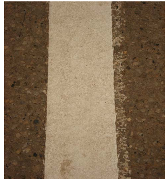
E. white Retro readings–298, 331, 302, 313, 353,336, 312, 294, 307, 303, 287, 292, 288, 286 – Average retro = 307 Mcd Initial retro-reflective readings are also very good on the west edge line location, marking looks very good, lots of glass beads in the marking.