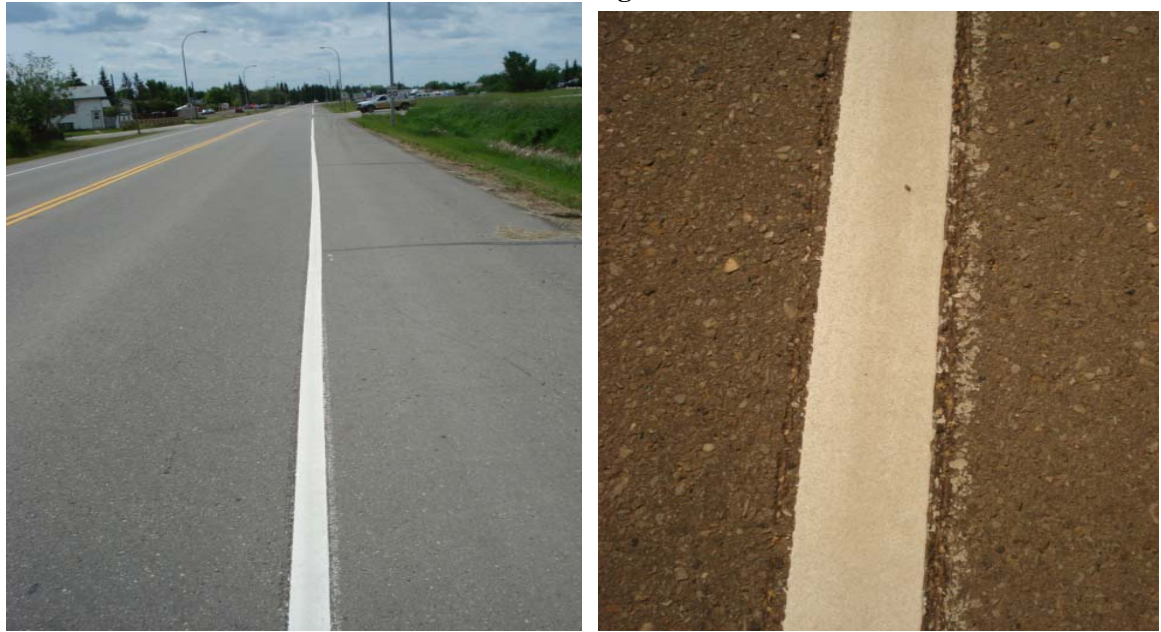
Retro readings—282, 271, 309, 302, 269, 276, 307, 301, 288, 306, 288, 287— Average retro = 291 Mcd Retro-reflective readings at this location are very good.

Chart showing average retro-reflective readings in Millicandelas (Mcd) at 3 locations along highway 2A (Ponoka):