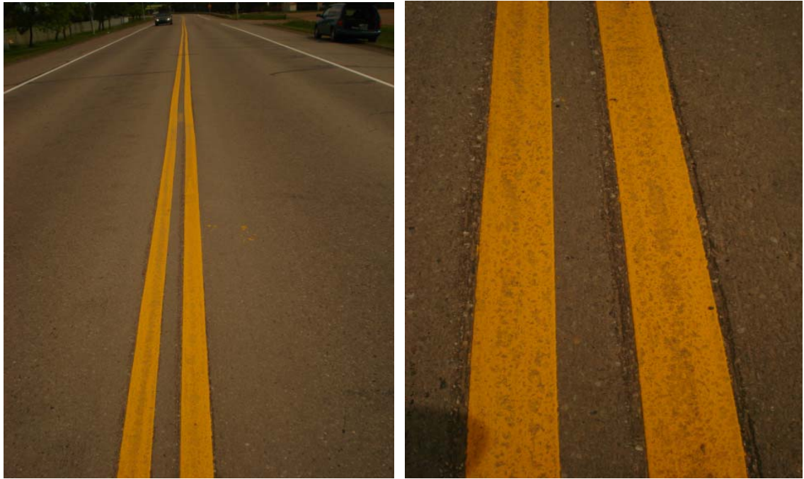
Yellow centerline appears to be slightly dirty looking Retro readings—71, 70, 70, 85, 75, 70, 75, 67, 66, 74, 69, 74, 112, 84— Average retro = 76 Mcd The initial retro-reflective readings on the yellow line at this location are very low; this could be attributed to the appearance of dirt on the line. The lower retro readings could also be attributed to the glass beads sinking lower in the material. Therefore, I would recommend that additional readings be taken some time in September after more wear has exposed the glass beads on the yellow lines, this would validate the readings. If the readings continue to be low then this line would not be acceptable.