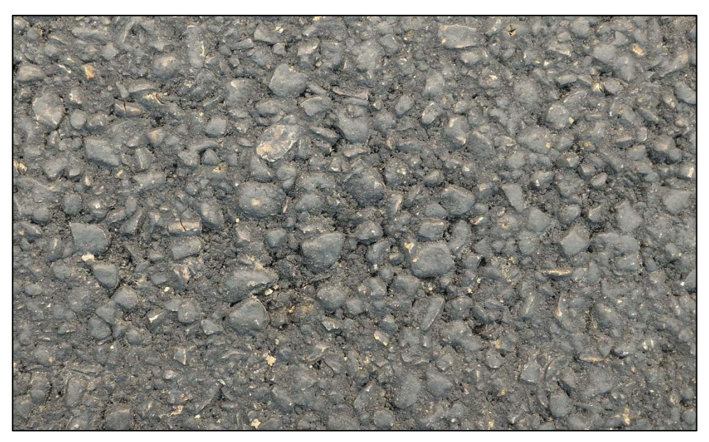
Photograph 9 - Moderate Segregation (bordering on Severe) (Close-Up)