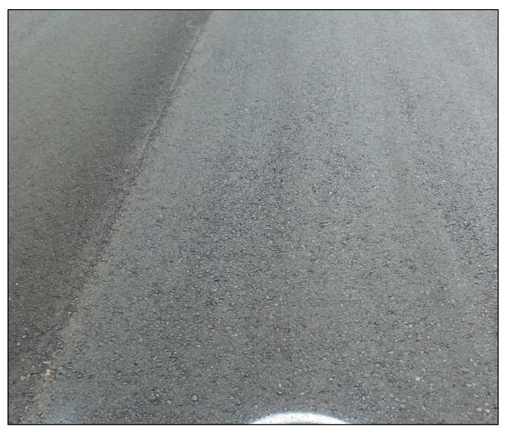
Photograph 3 - Slight Segregation