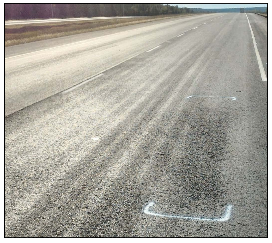
Photograph 8 – Moderate (bordering on Severe) Segregation