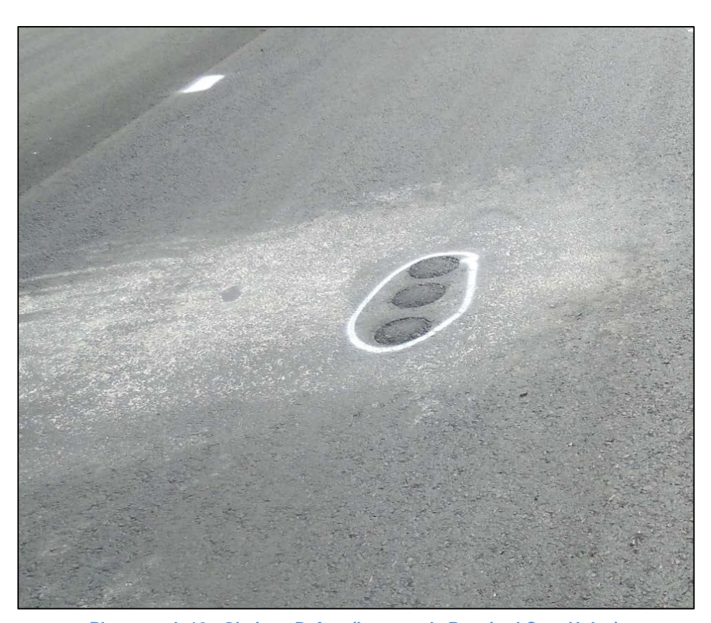
Photograph 16 - Obvious Defect (Improperly Repaired Core Holes)