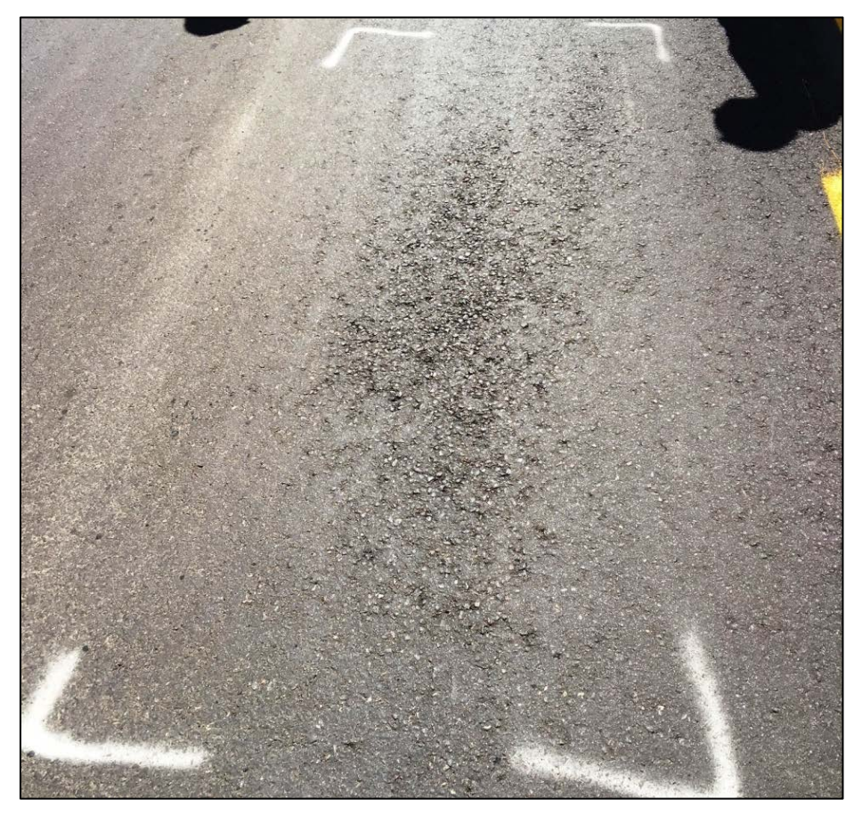
Photograph 7 - Moderate Segregation