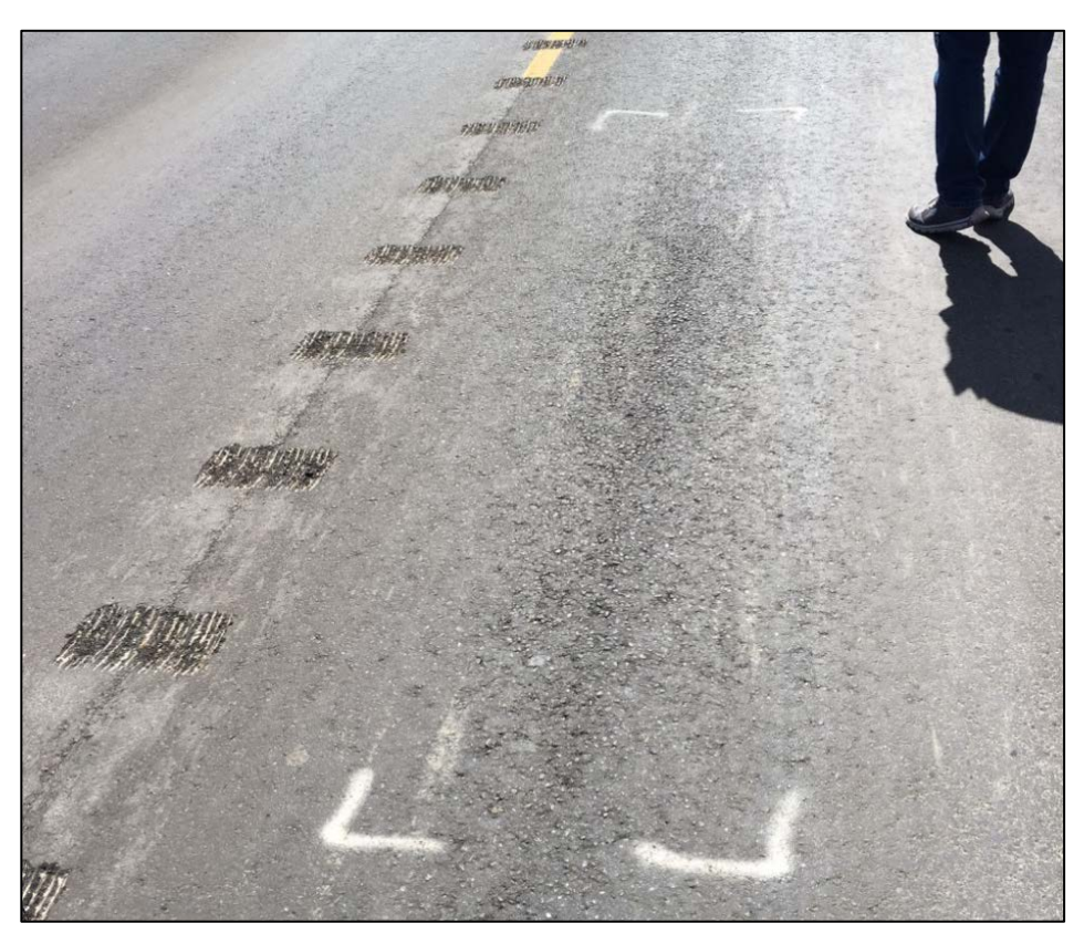
Photograph 6 - Moderate Segregation