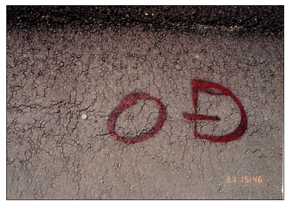
Photograph 17 - Obvious Defect (Hairline Cracking)