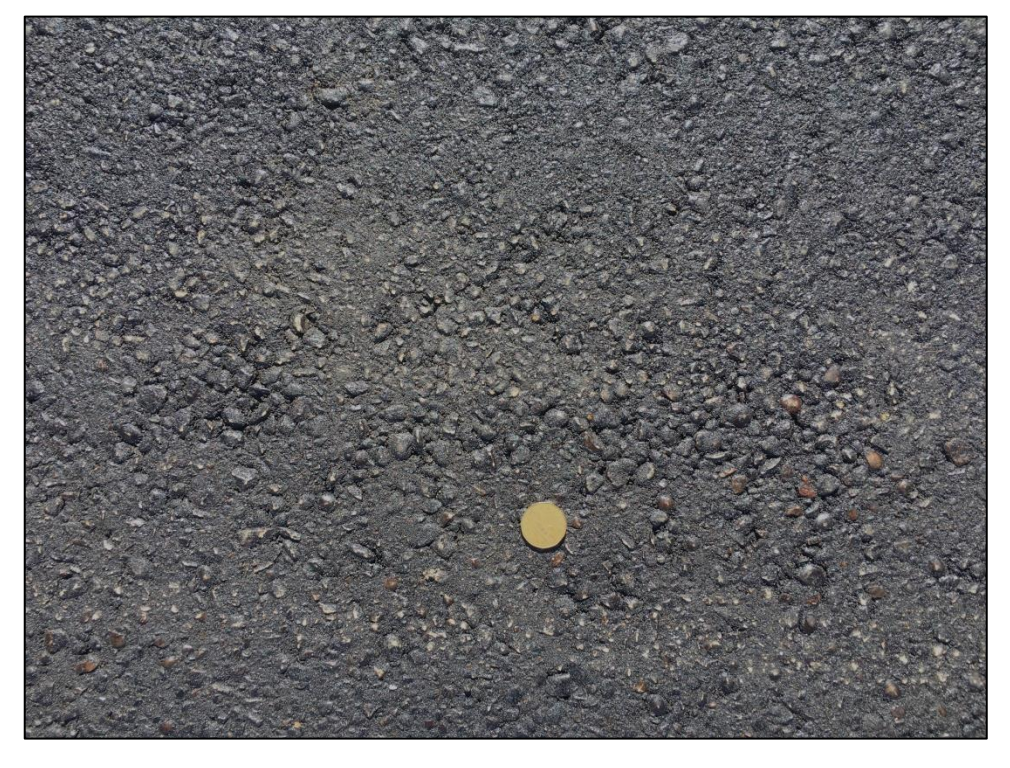
Photograph 4 - Slight Segregation (Close up)