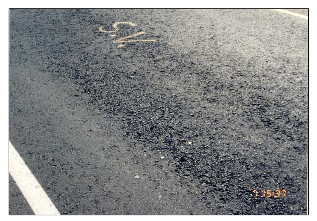
Photograph 11 - Severe Segregation