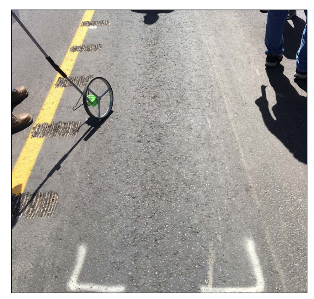
Photograph 5 - Moderate Segregation