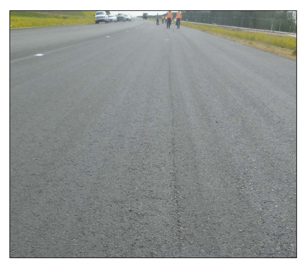
Photograph 13 - Centre-of-Paver Streak