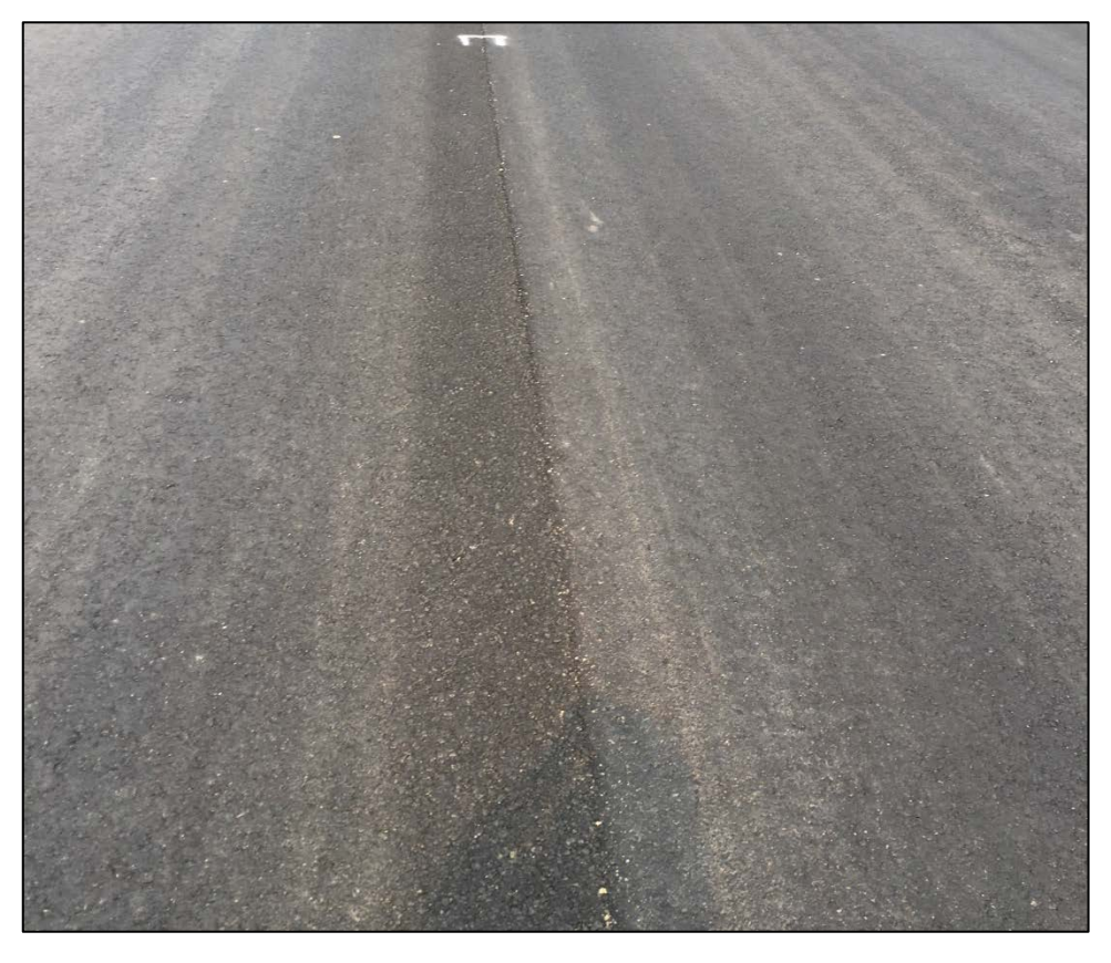
Photograph 14 - Improperly Matching Joint (View 1)