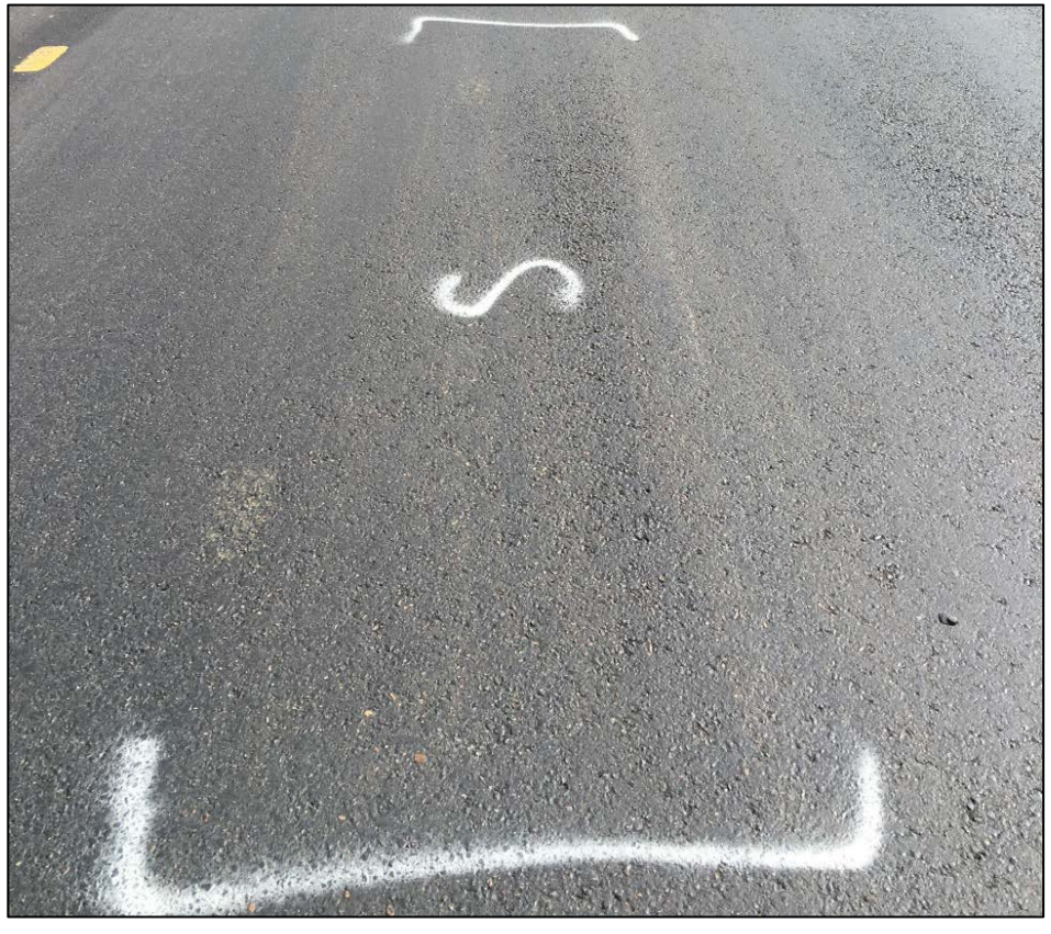
Photograph 2 - Slight Segregation