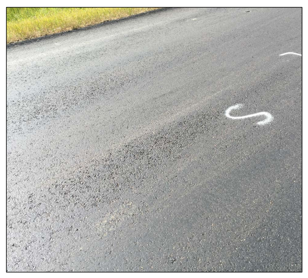
Photograph 1- Slight Segregation