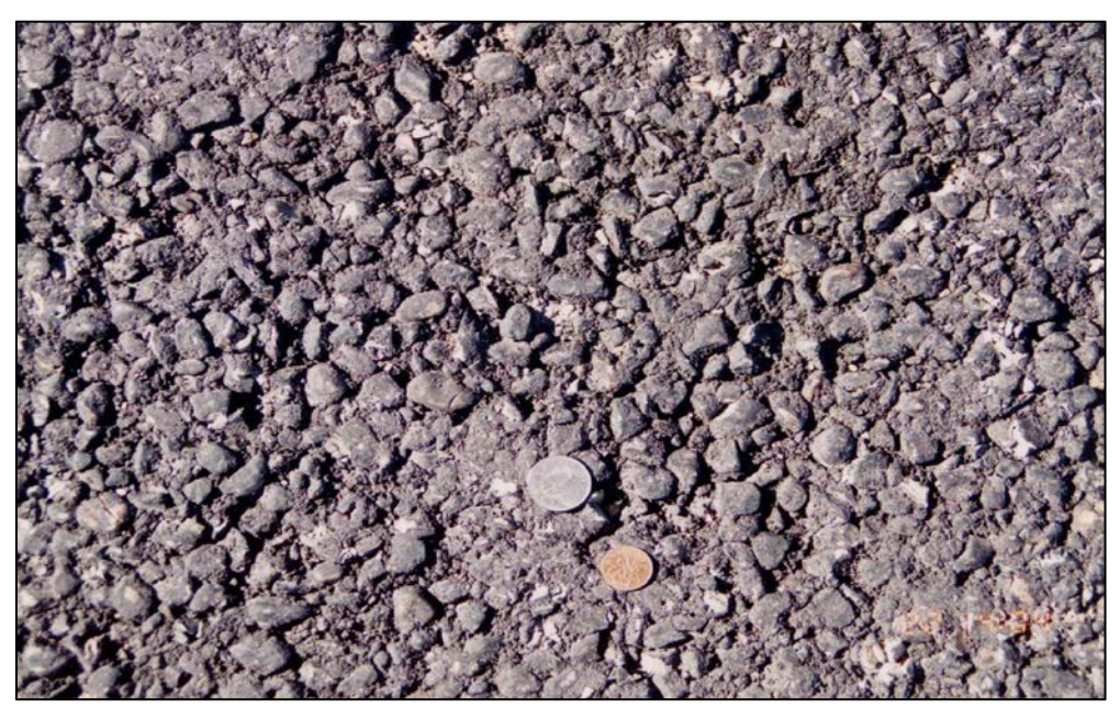
Photograph 12 - Severe Segregation (Close-Up)