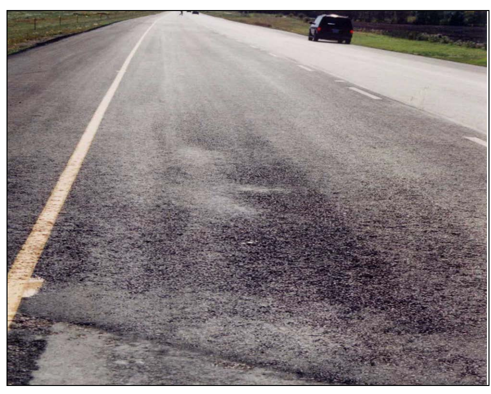
Photograph 10 - Severe Segregation