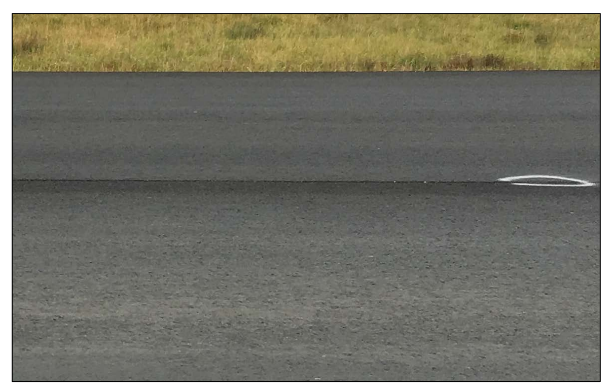
Photograph 15 - Improperly Matching Joint (View 2)