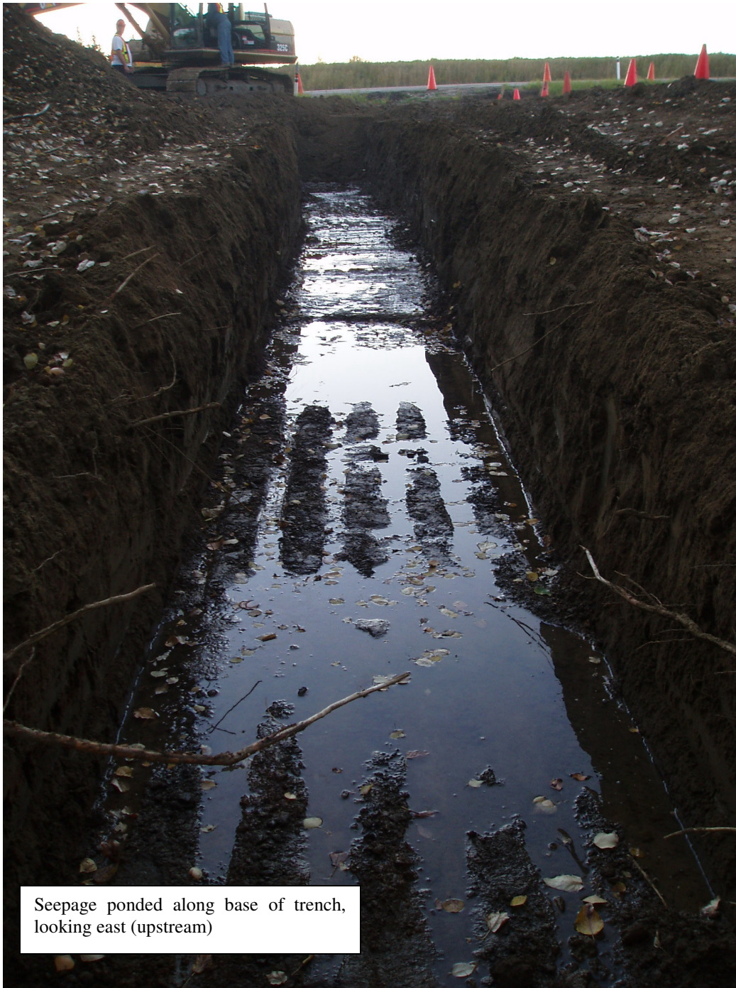
Seepage ponded along base of trench, looking east (upstream)