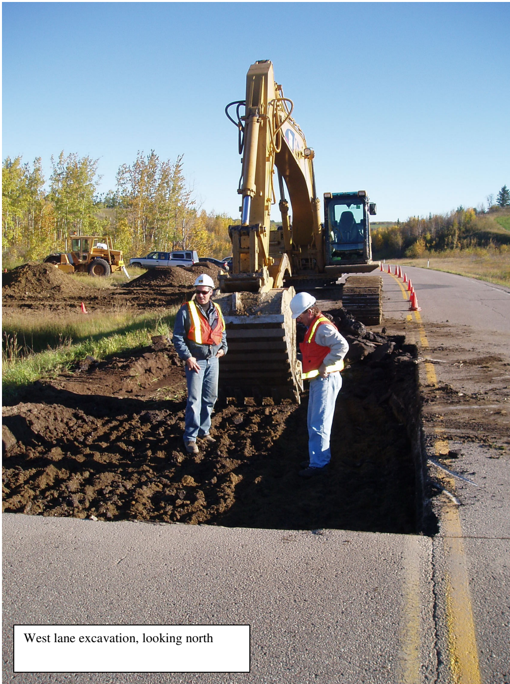
West lane excavation, looking north