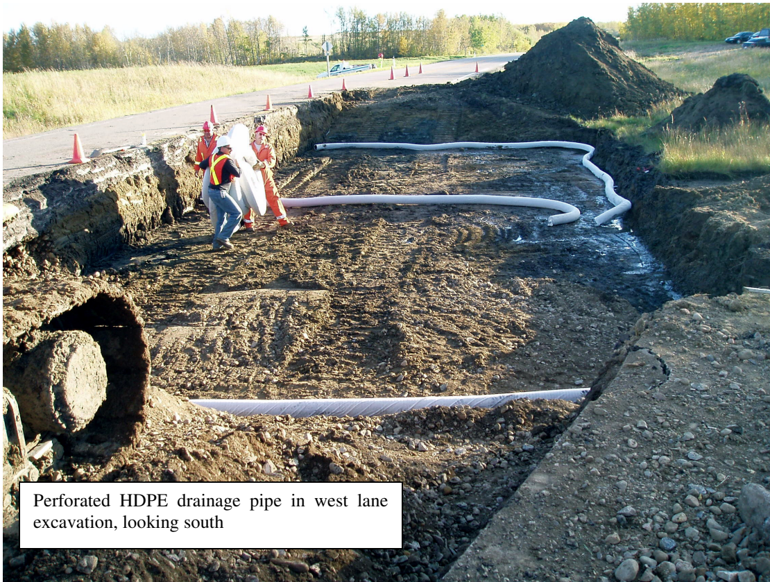
Perforated HDPE drainage pipe in west lane excavation, looking south