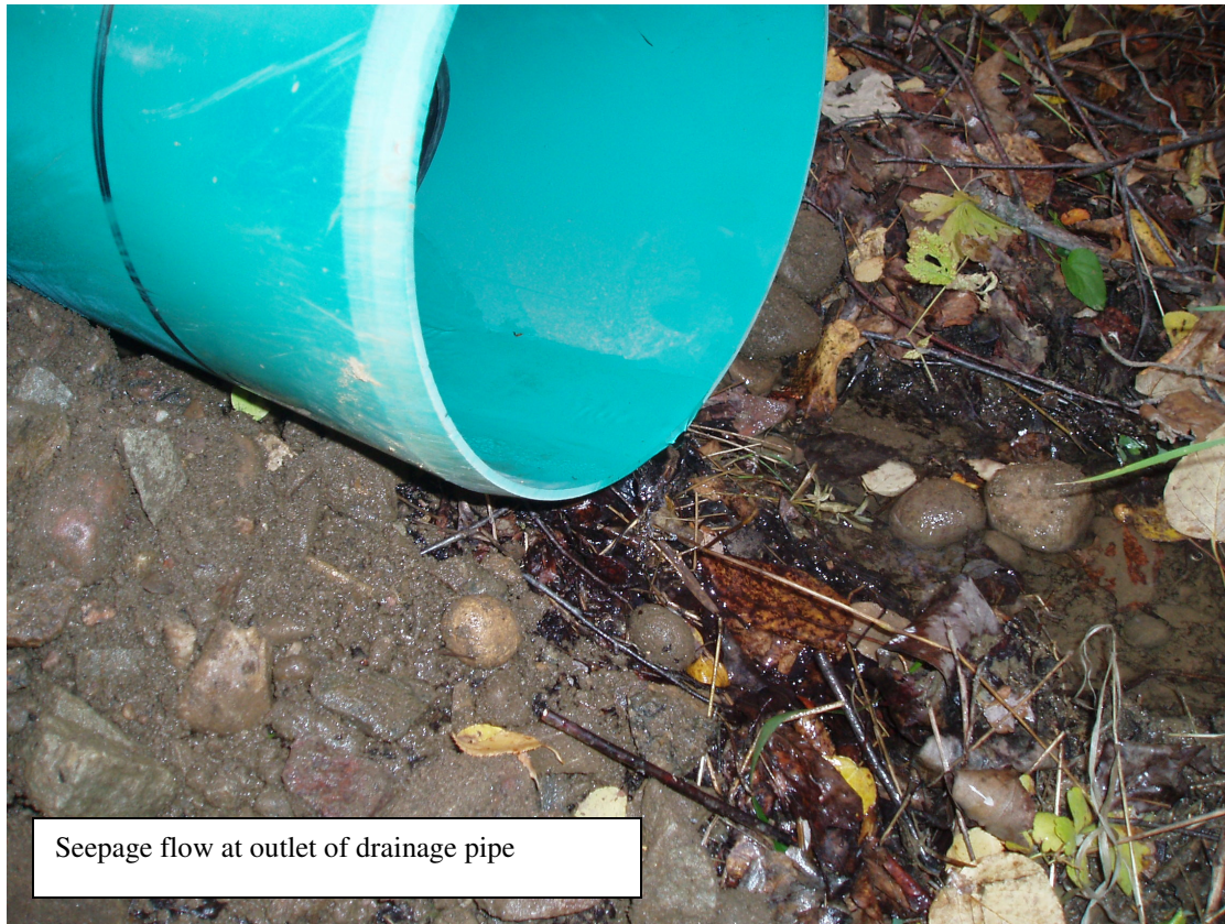
Seepage flow at outlet of drainage pipe