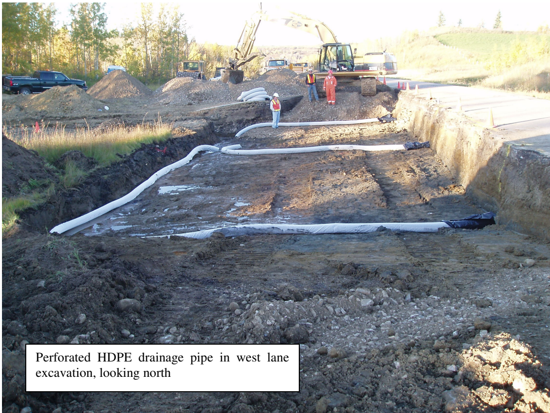
Perforated HDPE drainage pipe in west lane excavation, looking north