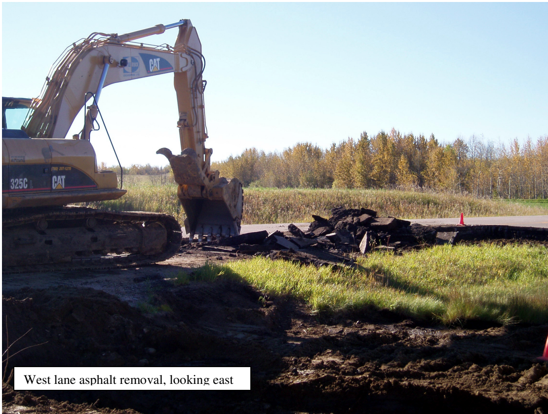
West lane asphalt removal, looking east