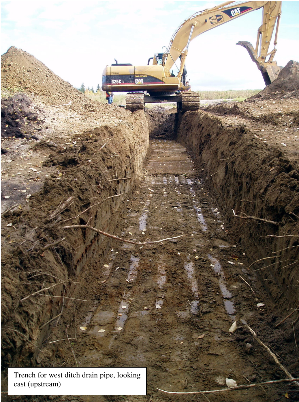
Trench for west ditch drain pipe, looking east (upstream)