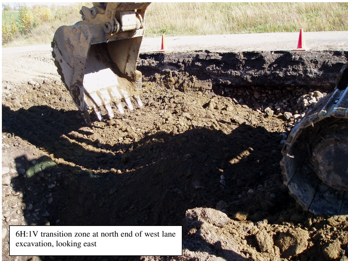
6H:1V transition zone at north end of west lane excavation, looking east