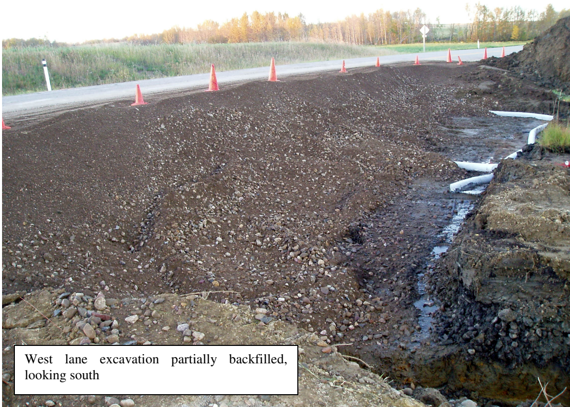
West lane excavation partially backfilled, looking south