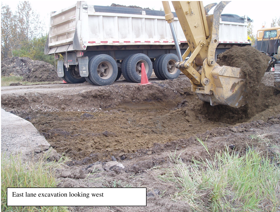
East lane excavation looking west