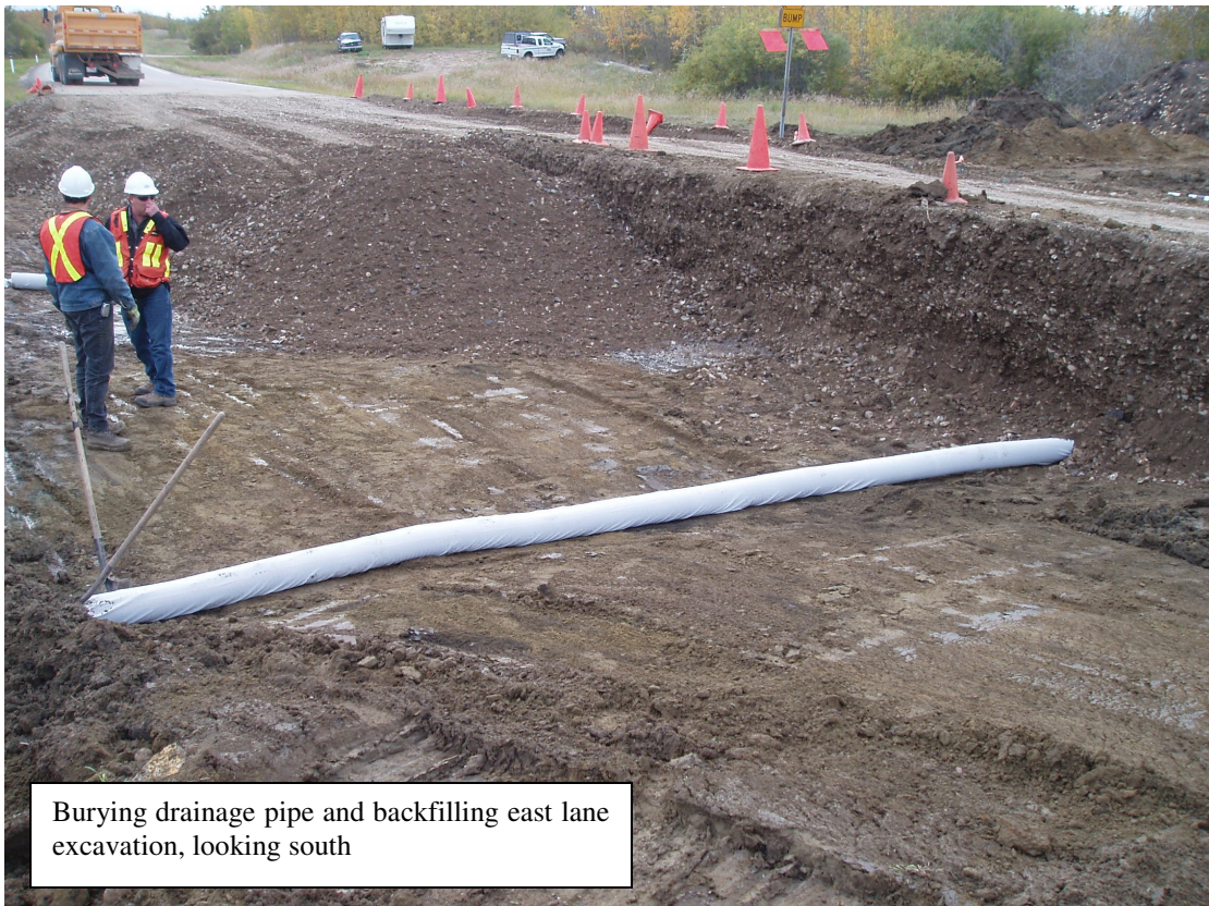
Burying drainage pipe and backfilling east lane excavation, looking south