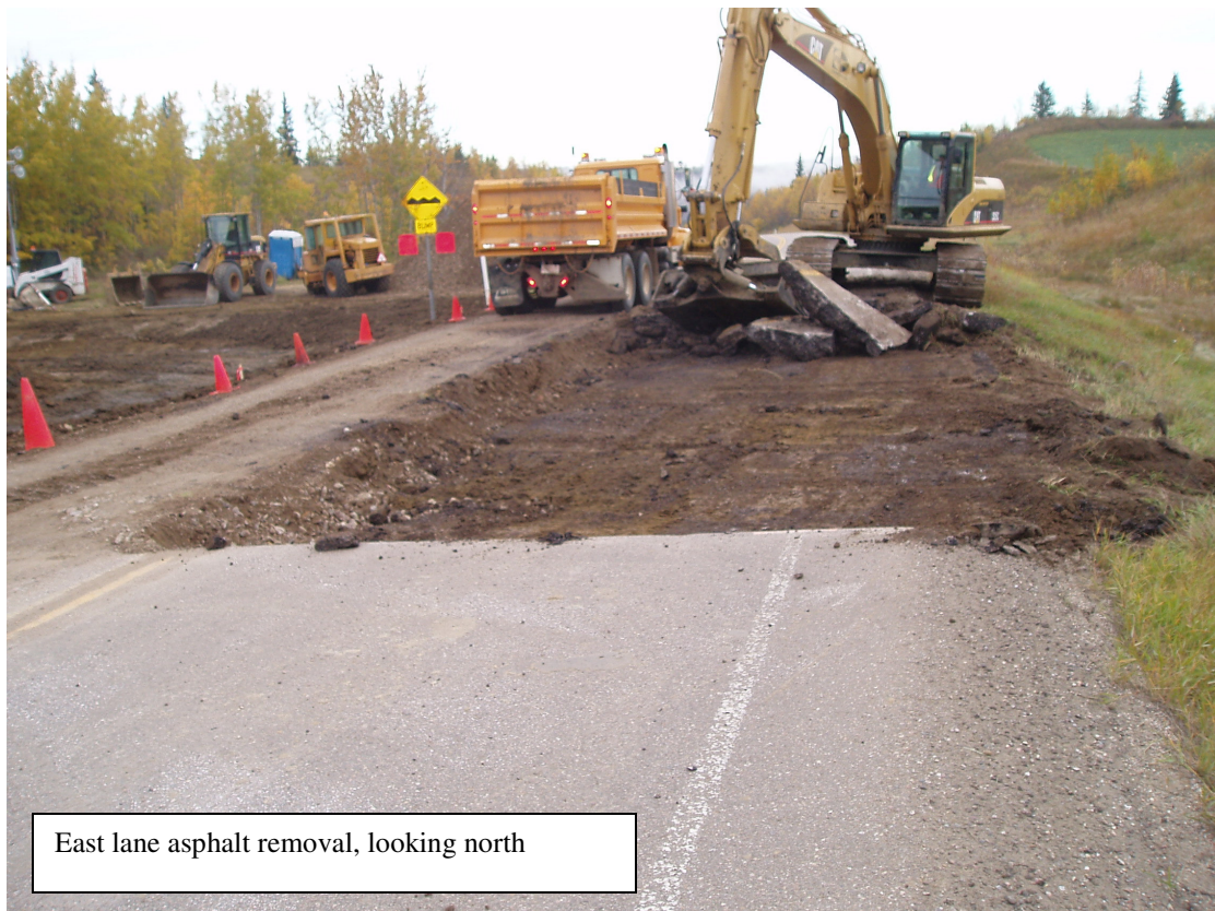
East lane asphalt removal, looking north