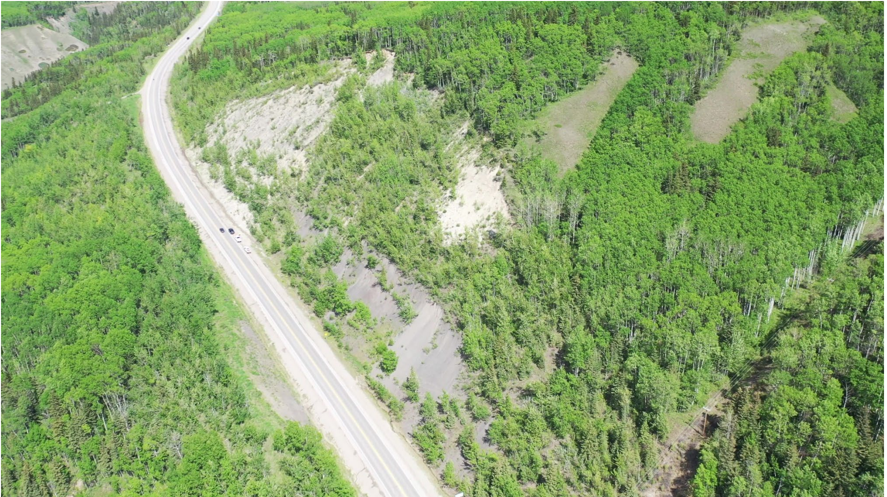
Photo 1 Overview of GP020-II site on Hwy 40:34. Photo taken June 13, 2022, with unmanned aerial vehicle (UAV) facing northeast.