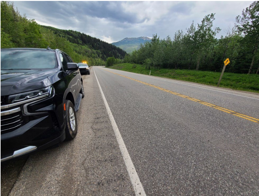
Photo 6 Pavement surface of Hwy 40:34. Photo taken June 13, 2022, facing northeast.