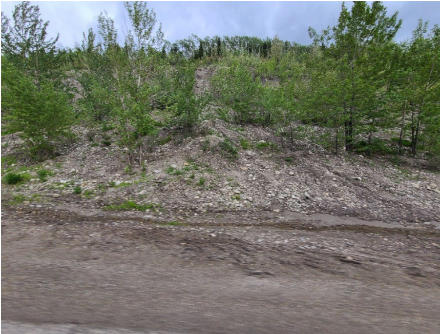
Photo 4 Water flowing in upslope/east ditch of Hwy 40:34 at toe of backslope. Photo taken June 13, 2022, facing northeast.