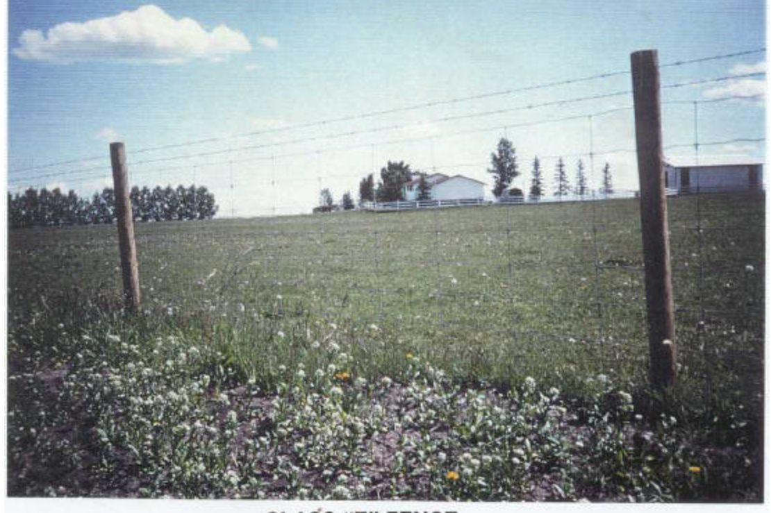
CLASS "E" FENCE