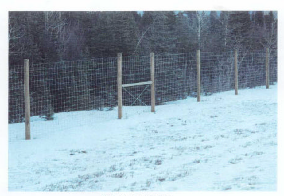
CLASS "F" FENCE