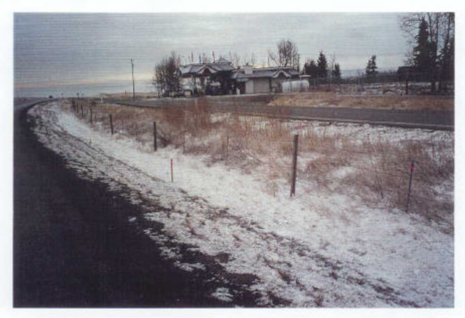
METAL FENCE STAYS