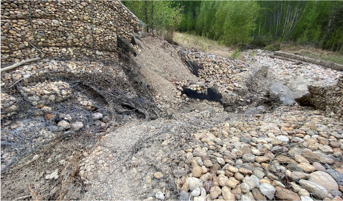
Photo 41-07.: View northwest towards the top of the gabion sidewall section that pulled apart and collapsed due to deep scour that undermined the base of the structure within the lower section. Slightly more visible damage relative to the 2024 condition.