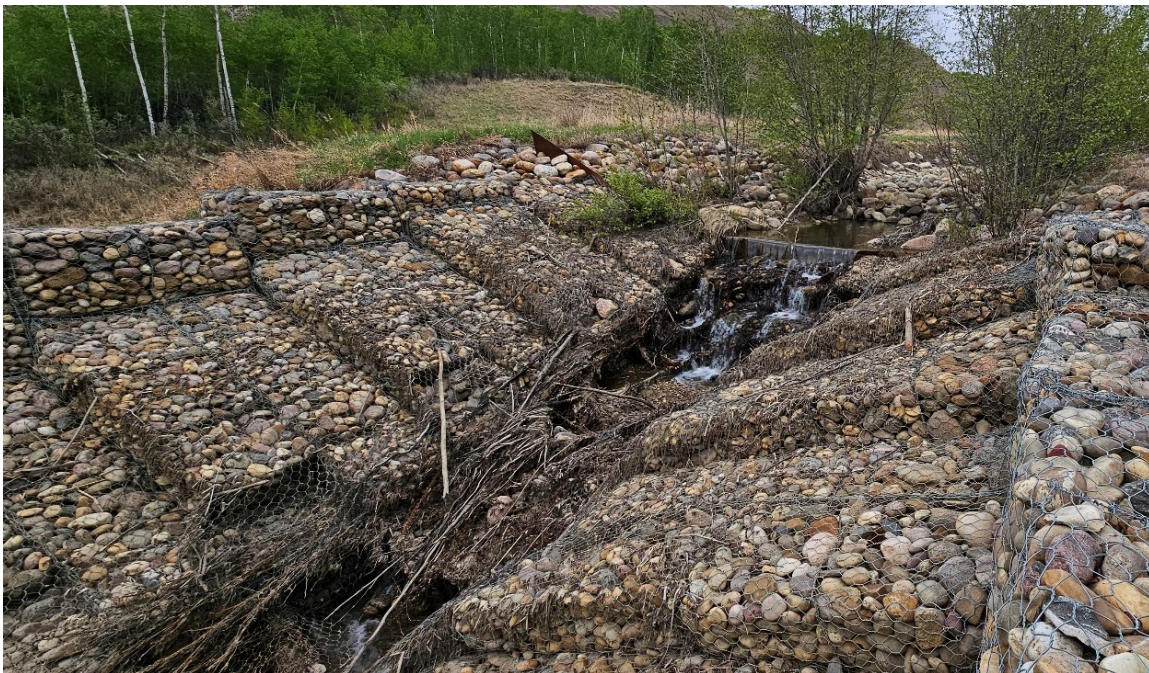
Photo 41-04.: View from the top/inlet of the curved gabion drop structure looking towards the northeast near km 31.79. Within the centre of the structure there was major basket deformation, broken basket wires and loss of rock due to downcutting within the thalweg. Scour below the baskets has resulted in an approximately 1 m drop in channel elevation. No major change from 2024.