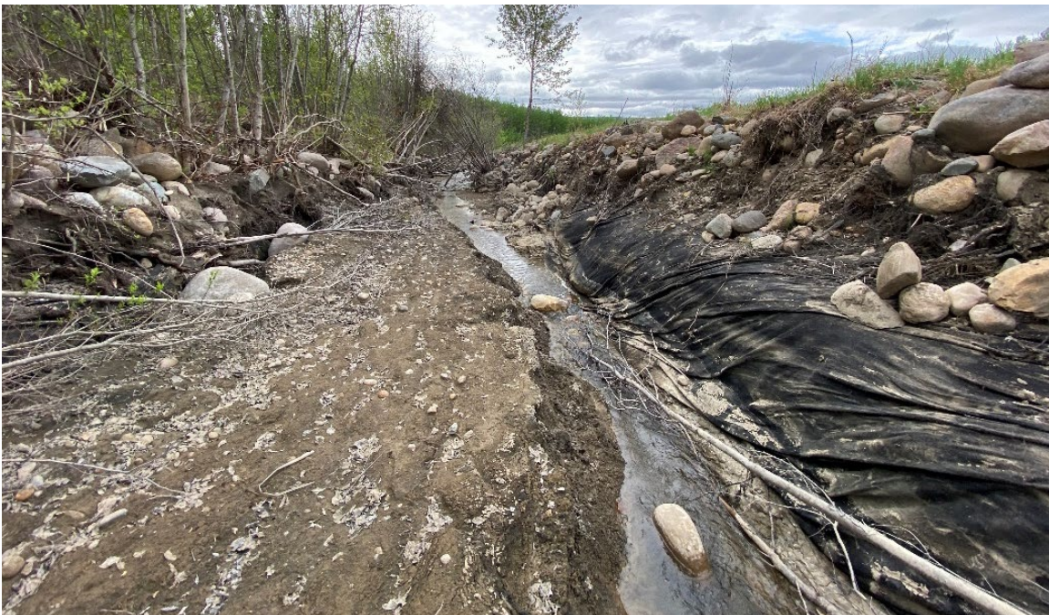
Photo 41-02.: Looking west (downstream) at the downcutting erosion within the channel near km 31.75 from the 2024 high flow event that washed out the riprap and exposed the geotextile. Erosion was slightly deeper within the thalweg relative to the 2024 condition.