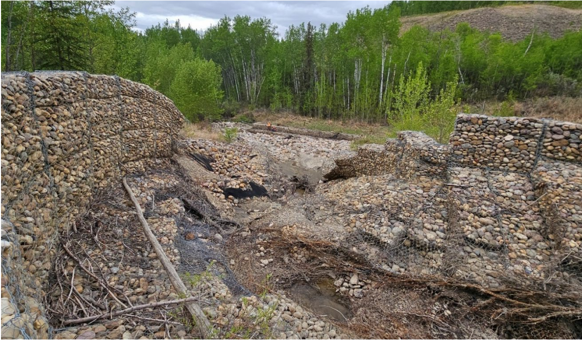
Photo 41-05.: View downstream (north) at the corner of the drop structure with extensive damage to the gabion baskets and wood debris buildup. Condition appeared slightly worse relative to the 2024 condition.