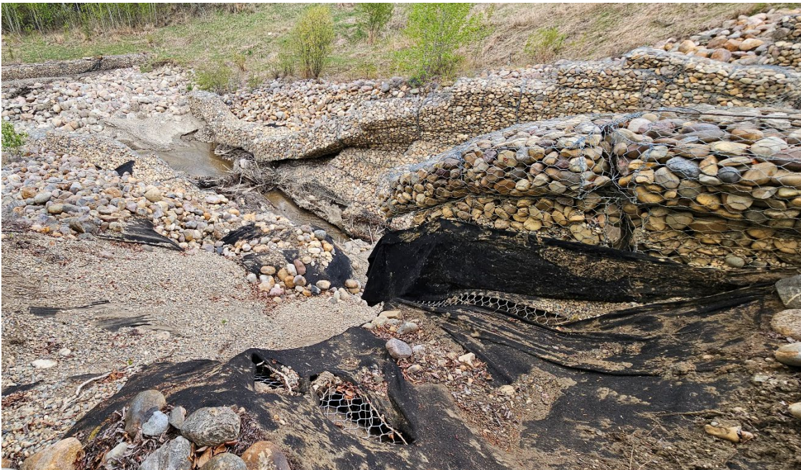
Photo 41-06.: View towards the northeast at the top of the gabion sidewall section that pulled apart and collapsed due to deep scour that undermined the base of the structure within the lower section. Some additional basket deformation and rock loss relative to the 2024 condition.