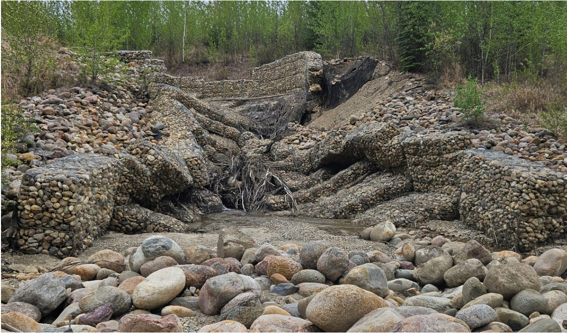
Photo 41-09.: View upstream (south) from the bottom of the drop structure. Extensive deformation and collapse of the structure due to scour and undermining below the baskets within the channel centreline. Minor downwards movement of the baskets towards the channel thalweg within the downstream section of the structure since 2024.