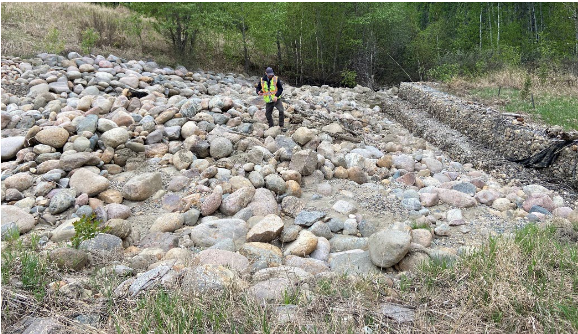
Photo 41-10.: Downstream view towards the west of the buildup of washed out riprap below the gabion drop structure within the natural channel.