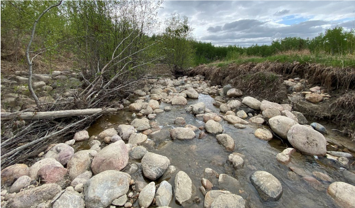
Photo 41-03.: View downstream (west) of the riprap displacement and north bank undermining near km 31.825. Some additional bank slumping relative to the 2024 condition.