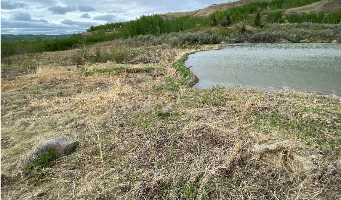
Photo 41-01.: Standing by the beaver dam near km 31.95 looking north at the upstream pond. Dam was intact and previous 2024 breach areas had been infilled from beaver activity.