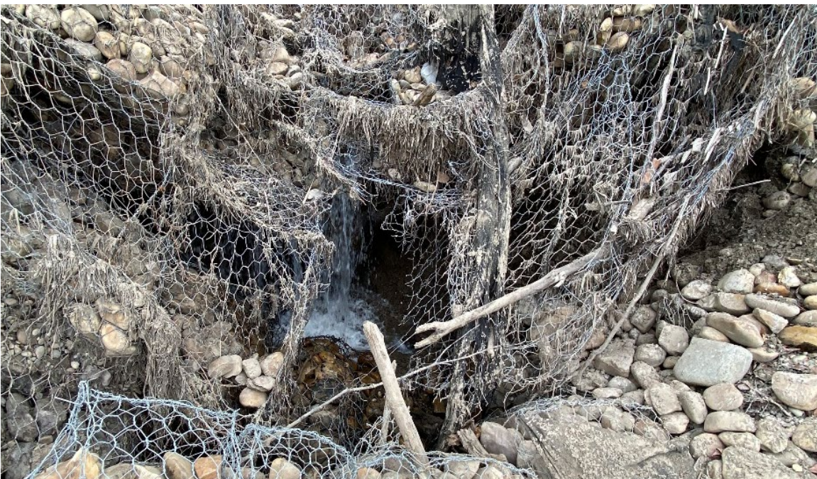
Photo 41-08.: Close-up of scour plunge hole at least 2 m deep that has formed within the thalweg downstream of the drop structure corner.